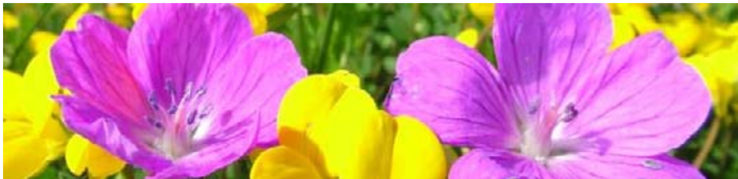
Bloody crane's bills and bird's foot trefoil

'Due North' brings together a collection of very interesting Finnish Photography with a 'Northern' analytical and conceptual approach to photography. This new exhibition will be opened on August 9 th at the Burren College of Art in Ballyvaughan by Finnish Ambassador Seppo Kauppila. The exhibition is mainly photographic, but also has an emphasis on modern art and artist-led creative exploration. This is an independent group exhibition organised in partnership by The Finnish Institute in London, Irish Arts Council, Burren College of Arts, Frame and Kuvataideakatemia. More info from www.burrencollege.ie also Jan Kaila - jan.kail@kuva.fi Martina Cleary - cleary_martina@hotmail.com